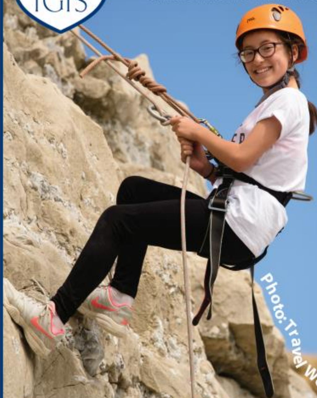
Photo: Travel Week 2018

admissions@groveschool.co.uk | www.groveschool.co.uk